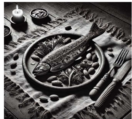
Spice-Kissed Sea Trout, among the house favorites

Juicy spiced apples under a buttery crumble top, drizzled with warm maple syrup and served with a dollop of clotted cream.