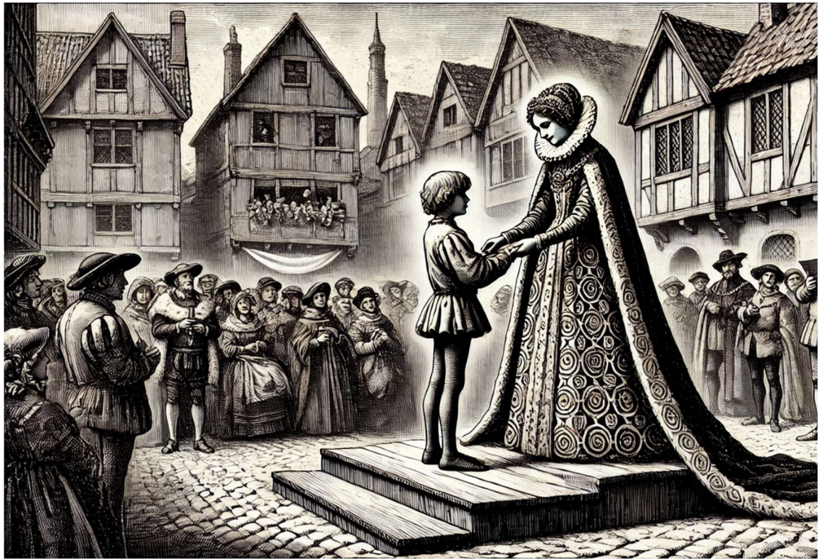
The peasant boy Kosin Field receiving a metal of bravery and the title of squire from the governess the Lady Rasinfer in the public square of Yaport.

A child fell through a crack in the earth. She was trapped for several days, no food, no water, and no hope. A hunter tracking pray came across a strip of cloth and marks in the dirt indicating a slip. Moving the brush he found the small hole and the marks of a child sliding into it. He called once, there was no sound, he called a second time and heard a faint cry. To the city he ran to gather assistance. Many came but, none able to fit in the small hole. No magic about, no potion or scroll or practitioner of magic in the city able to assist. A small boy stepped forward claiming he could fit. With ropes, down the hole he went, descended into the dark of the earth. Time seemed to stretch, moments seemed to take longer, the rope still being pulled into the hole. Another rope attacked, then another, and yet another. With the fourth rope tied, the rope stopped, again is was if time stopped, there was no sound, no one breathed a breath. There were tugs on the rope, the men pulled and pulled. The third rope appeared, then the second, then the first, then a small hand, then the child, he was clutching another with his other hand, a girl child dressed in dirty finery. The lass was the youngest daughter of a visiting lord, she had been missing for days yet he was not aware. Lady Rasinfer governor of Yaport gave him an ear full of her thoughts. Presented the brave peasant lad with metal and title