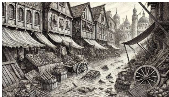
The newly built Coral Plaza market in Aynor devastated by flood waters.

The grand opening of the new Coral Plaza shopping center has been delayed for several weeks after a rogue wave pommelled the coastline of Aynor yesterday. A surge wave of some 14 feet swept through the docks and into the city. Other than minor cuts and bruising there were no serious injuries to report. A few buildings with windows on the surf side were destroyed and some homes and businesses were flooded out.